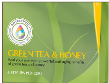
Green Tea & Honey $57

Heal your skin with powerful anti-aging benefits of green tea and honey.