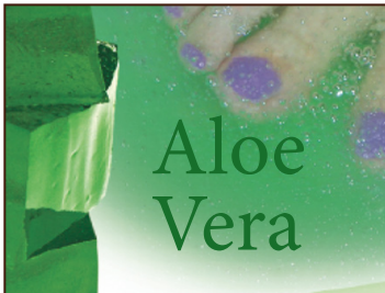
Aloe Vera $62

Aloe Vera & Lavender is the latest health and beauty craze and it's easy to see why. This packet is crammed full of Aloe Vera juice, containing amino acids, vitamins, and minerals, making it one of the most effective natural detoxifiers.