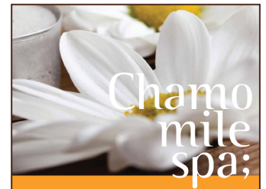
Chamomile Spa $57

Made with all natural chamomiles, this flower has been used for centuries as is known as the Miracle flower. Chamomile is perfect for sensitive skin, because it contains dozens of antioxidants; which helps heal wounds, inflammation, psoriasis, and even eczema.