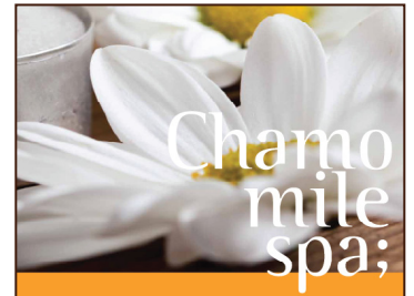
Chamomile Spa $52

Made with all natural chamomiles, this flower has been used for centuries as is known as the Miracle flower. Chamomile is perfect for sensitive skin, because it contains dozens of antioxidants; which helps heal wounds, inflammation, psoriasis, and even eczema.