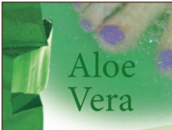
Aloe Vera $57

Aloe Vera is the latest health and beauty craze and it's easy to see why. This packet is crammed full of Aloe Vera juice, containing amino acids, vitamins, and minerals, making it one of the most effective natural detoxifiers.